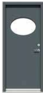
Plain with oval glass