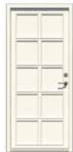
Multi lights door