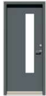
Plain with long rectangle glass and kick plate