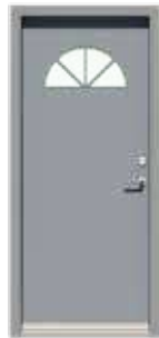
Plain with farmhouse glass