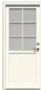
Top multi lights and one bottom panel