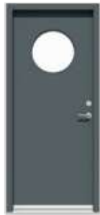
Plain with round glass