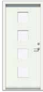
Plain with square multi lights