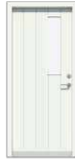
Vertical with small rectangle glass