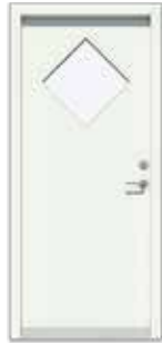
Plain with diamond light