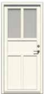
Two top lights and bottom panels