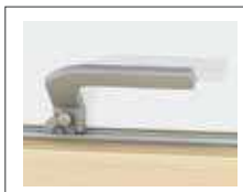
Espagnolette with child-lock