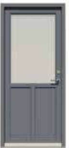
Glazed door with 2 bottom panels