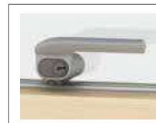
Espagnolette with cylinder lock

All espagnolettes can be supplied with a lock and key for extra security or with a child-lock button.