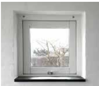
➤ Conventional window