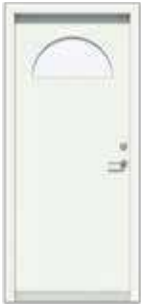
Plain with half round glass