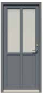
Two top lights and 2 bottom panels