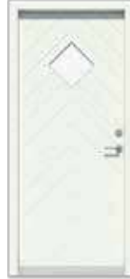
Fishbone with diamond glass