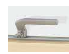
Espagnolette with lock